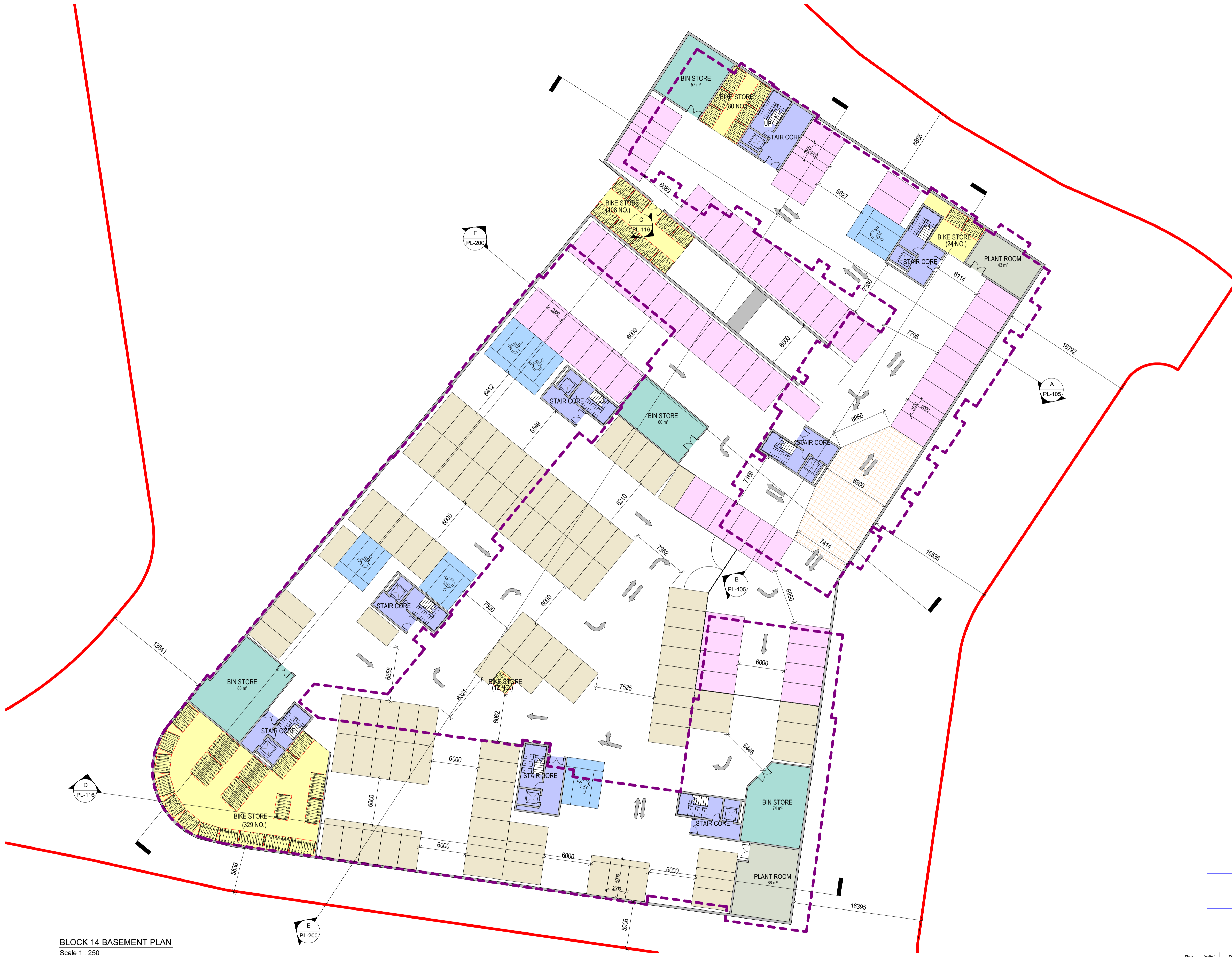
BLOCK 14 BASEMENT PLAN Scale 1 : 250